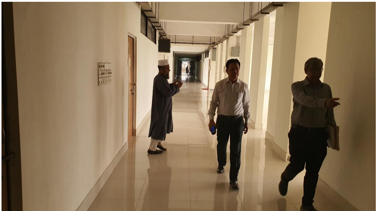
Figure 2.5: Visiting proposed site of the university innovation hub