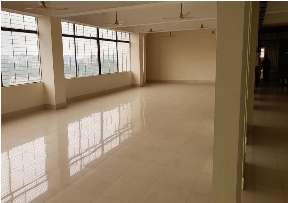
Figure 2.2: Proposed site of the university innovation hub

Total area of this floor is presently vacant. This floor is constructed recently and reserved the block for the Innovation Hub. The other spaces of this floor are going to prepare for doing usable. So, the space has sufficient ventilation facilities and suitable for establishing such a Hub (Figure 2.2 -2.6).