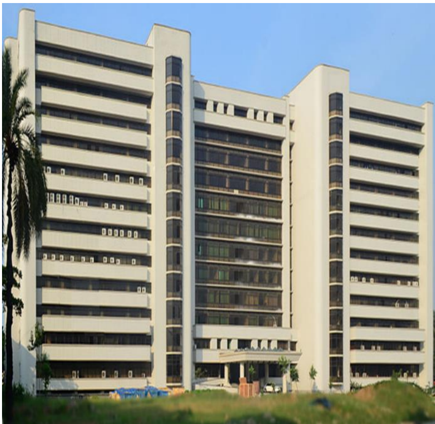
Figure 2.1: Proposed building where Innovation Hub will be established

Bangladesh University of Engineering and Technology (BUET) is situated at Polashi adjacent to Dhaka University and Dhaka Medical College. The innovation Hub will be established in the ECE Building (8th Floor), West Palashi Campus, BUET, Dhaka 1205. The project will be implemented on the 8th floor of the existing ECE Building at the allocated space for Research and Innovation Centre for Science and Engineering (RISE).