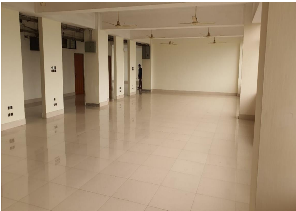
Figure 2.3: Proposed site of the university innovation hub