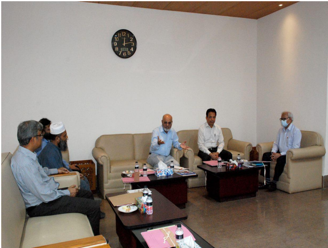
Figure 4.2: Meeting with Vice Chancellor and Director RISE