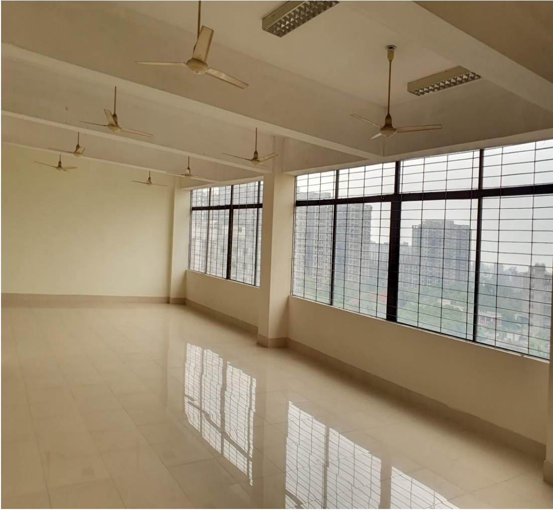
Figure 2.6: Proposed site of the university innovation hub