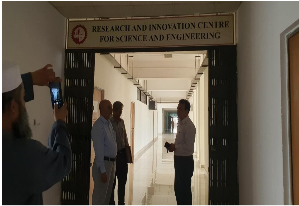
Figure 2.4: Visiting proposed site of the university innovation hub