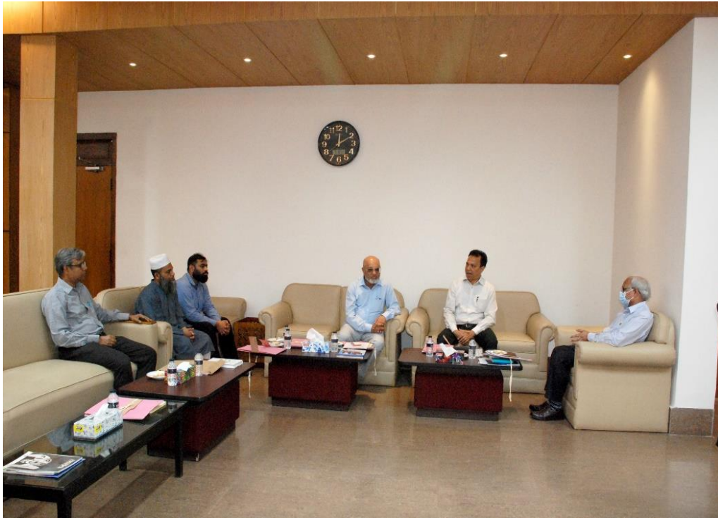
Figure 4.1: Meeting with Vice Chancellor and Director RISE